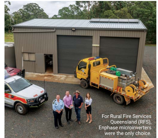
For Rural Fire Services Queensland (RFS), Enphase microinverters were the only choice.

We've been perfecting safe, smart and tough microinverter technology for more than 14 years on over one million rooftops.